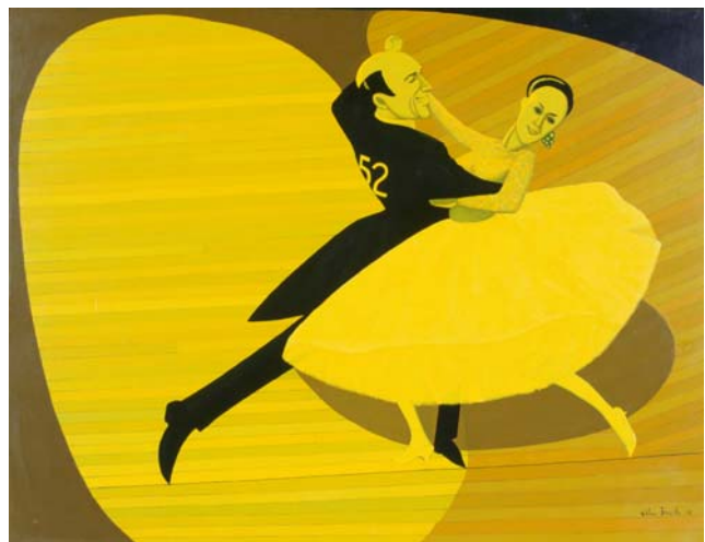
John Brack British Modern , 1969 oil on canvas State Art Collection, Art Gallery of Western Australia Purchased 1984