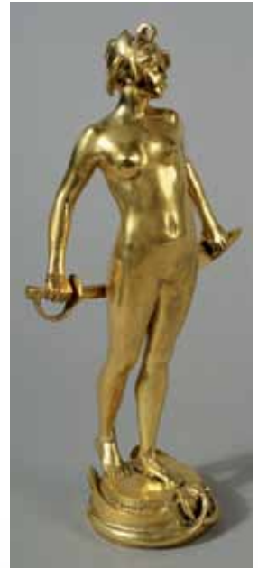
Bertram Mackennal Salome c1895-1900 gilt bronze 29 x 14 x 8 cm State Art Collection, Art Gallery of Western Australia Purchased 1976

tinted and painted plaster 70.3 x 21.1 x 17.9cm (height) State Art Collection, Art Gallery of Western Australia Purchased through the TomorrowFund, Art Gallery of Western Australia Foundation, 2010