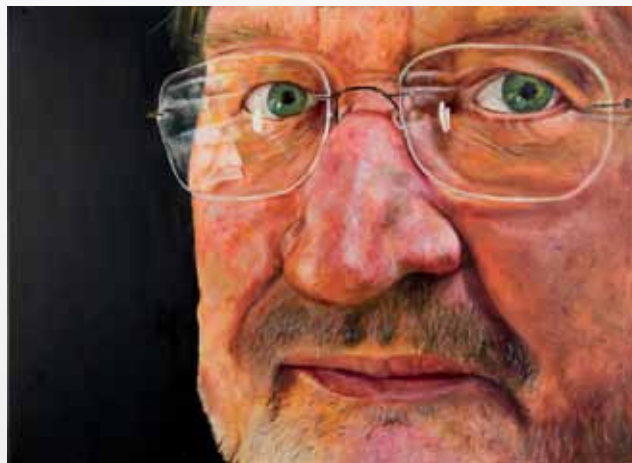
A work from Year 12 Perspectives 2010

Always a mix of the political, the intimate, the reflective and the vibrant, it promises a stunning look into the minds of incredibly creative young people. Most of all, though, full of highly accessible and entertaining works it highlights the ongoing necessity of art making as a platform to re-think and re-imagine the world around us.