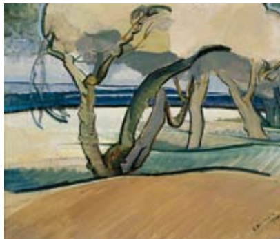
Elise Blumann On the Swan, Crawley 1938 oil on cardboard, 61.3 x 74.0 cm State Art Collection, Art Gallery of Western Australia Purchased 1976 © Elise Blumann 1938