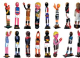
Dinni Kemarre Centre bounce 2007