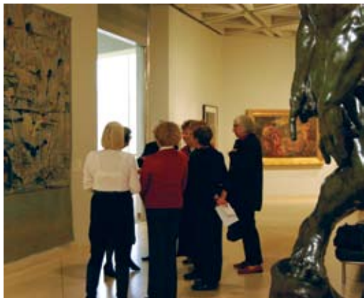
Foundation Picture Club August 2008