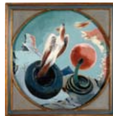
Paul Nash Nest of the Phoenix 1937 oil on canvas, 87.6 x 83.8 cm State Art Collection, Art Gallery of Western Australia Purchased 1977