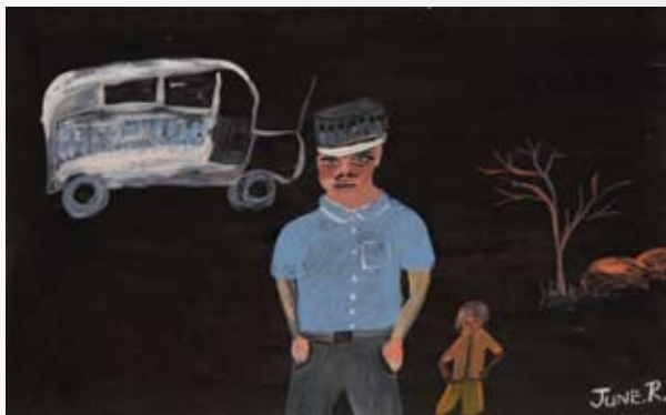
June Walkutjukurr Richards The Policeman 2006 acrylic on canvas, 67.8 x 109.1 cm Courtesy Warburton Collection Image © June Walkutjukurr Richards