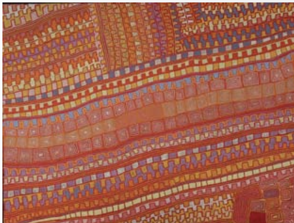
Patrick Tjungurrayi Untitled 2006 acrylic on linen, 183.0 x 244.0 cm

The winner of the People's Choice Award will be announced on 6 January 2009.