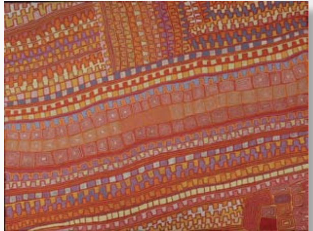
Patrick Tjungurrayi Untitled 2006 acrylic on linen, 183.0 x 244.0 cm Courtesy of Barry Fitzgerald Image © the artist, courtesy Papunya Tula Artists

The winner of the People's Choice Award will be announced on 6 January 2009.