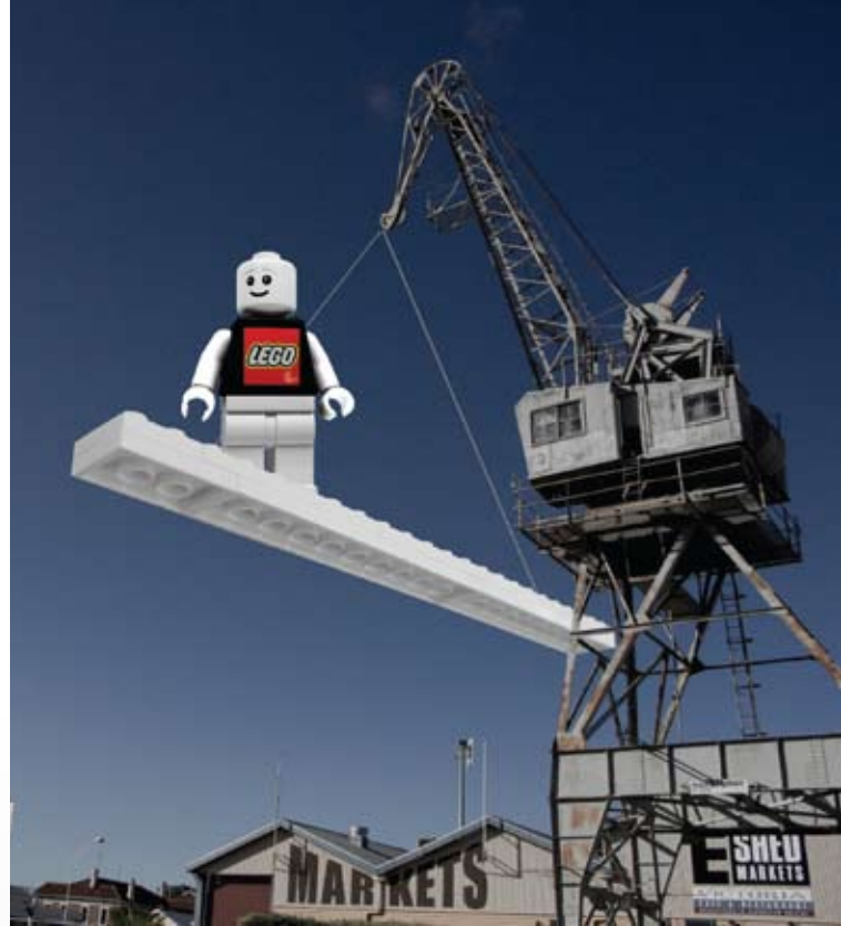
Sponsored by Fielders, ARUP, Lego, Danpalon, Dulux, Gaggenau, Gainborough & Miele.