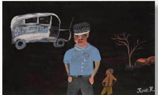
June Walkutjukurr Richards The Policeman 2006 acrylic on canvas, 67.8 x 109.1 cm Courtesy Warburton Collection Image © June Walkutjukurr Richards