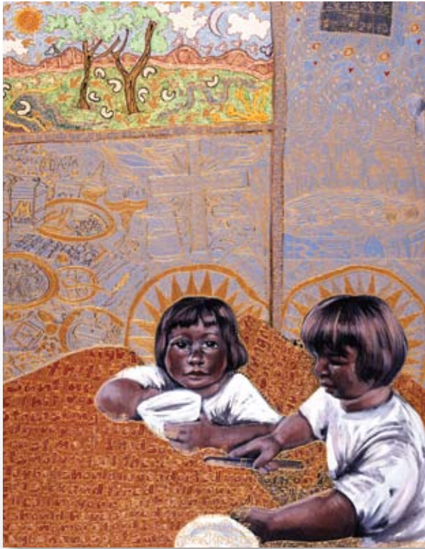
Julie Dowling Money: Before pension day 1999 synthetic polymer paint, ochre and gold on canvas, 107.0 x 83.0 cm State Art Collection, Art Gallery of Western Australia Purchased 1999

Our very popular Art Trail returns for the summer holidays! Solve the clues to discover the hidden secrets of the Gallery and its artworks. Complete the trail and enter the draw to win a fantastic pack of art supplies! The trail is designed for two age groups, 5–8 years and 9–13 years old.