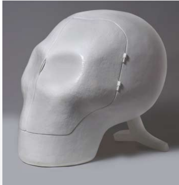
Atelier van Lieshout

THING beware the material world is a bold new exhibition that celebrates the human impulse to shape and re-shape the world around us. Including objects made from processes that range across hi-tech machining, creative recycling and delicate handcrafting, THING features furniture, lighting, jewellery, sculpture, and photography from around the globe.