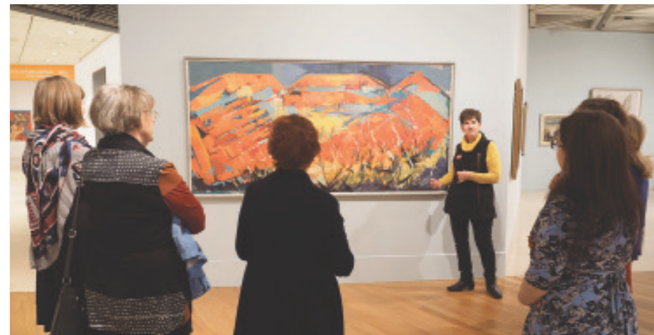
• Visitors on tour with an AGWA Guru Guide.

Groups other than traditional school classes, for example home school group networks, alternative schools and special needs and disability groups, are continuing to participate in AGWA education programs.