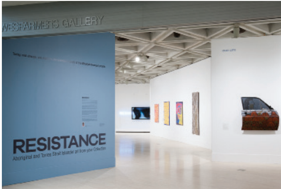
• Resistance 8 November 2015 – 21 February 2016.

Some of the exhibitions on display in 2015-16.