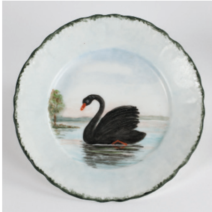
May CREETH Black Swan of Western Australia 1929 hand-painted china 1.7 x 15.2 cm diameter State Art Collection, Art Gallery of Western Australia Purchased 2016