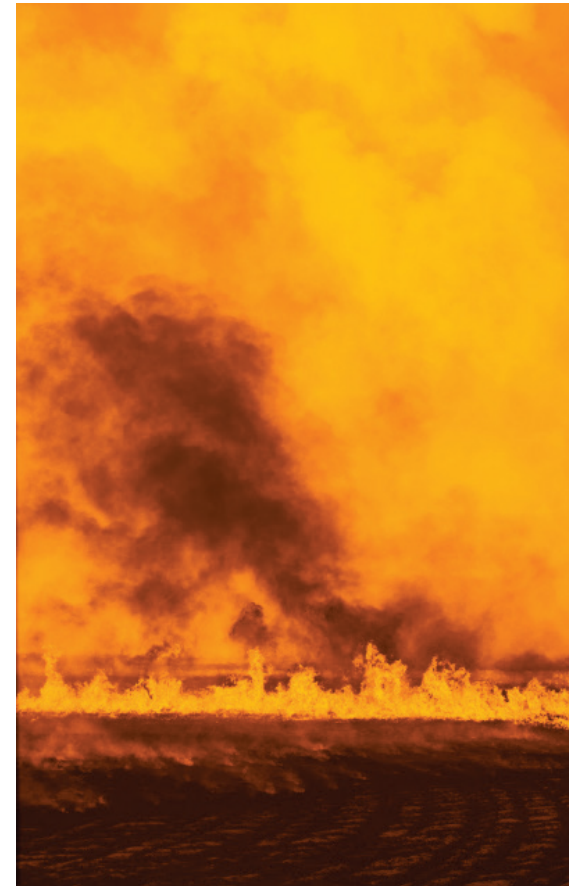
Brad RIMMER Wyalkatchem Autumn Fire #3 2015 giclee prints on Hahnemuhle paper behind orange acrylic, framed diptych 120.0 x 80.0 cm (overall) State Art Collection, Art Gallery of Western Australia Purchased through the TomorrowFund, Art Gallery of Western Australia Foundation, 2016