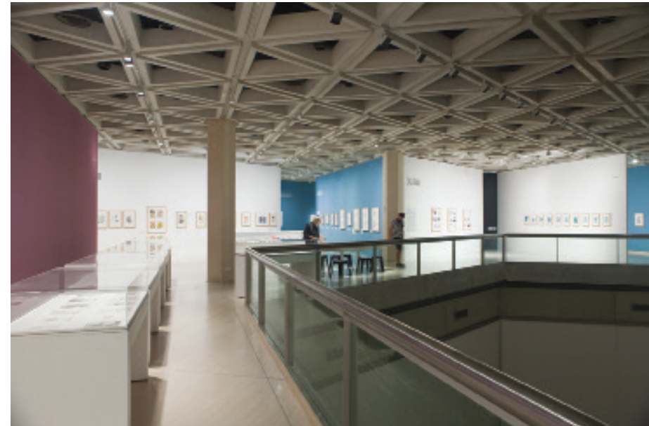
• Comic Tragic: the exploding language of contemporary comic art 9 April – 25 July 2016.