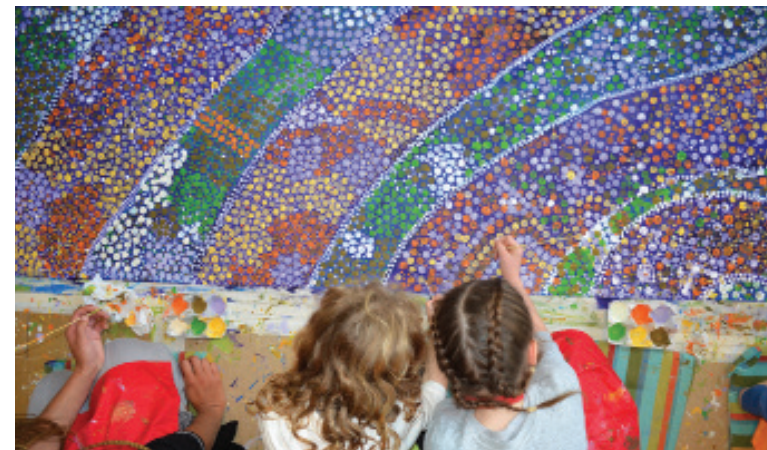
• Community canvas workshop during NAIDOC Week.

Purchased with assistance from the Friends of the Art Gallery, 1988