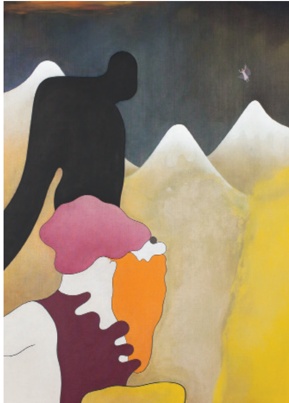
Brent HARRIS Peaks 2015 oil on linen 132.5 x 96.5 cm State Art Collection, Art Gallery of Western Australia Purchased through the TomorrowFund, Art Gallery of Western Australia Foundation, 2015