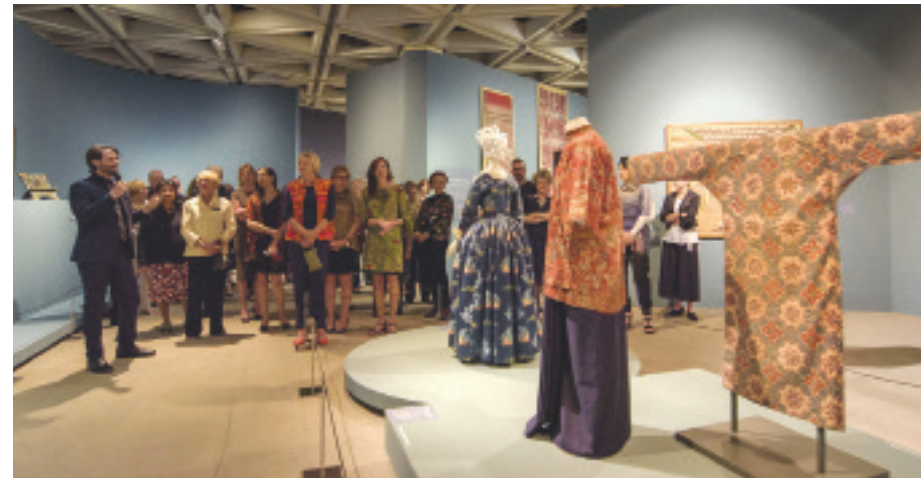
• Curator tour of Treasure Ships exhibition.

“I’m from North America, I’ve never been here before and it was just beautiful.”