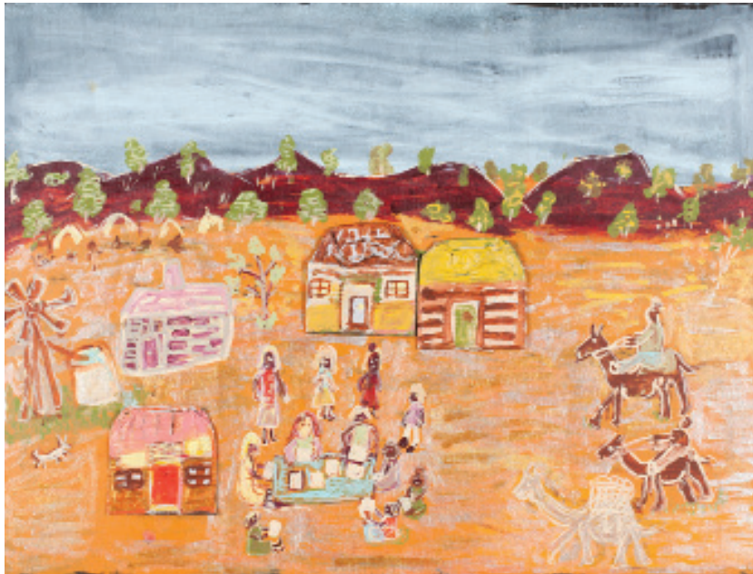
Eunice Yunurupa PORTER

Riding camels – Warburton Mission times 2014