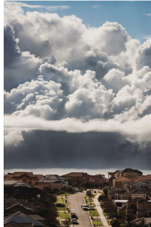
Graham MILLER Mt Claremont 2015 pigment print 125.0 x 83.0 cm State Art Collection, Art Gallery of Western Australia Purchased through the TomorrowFund, Art Gallery of Western Australia Foundation, 2016