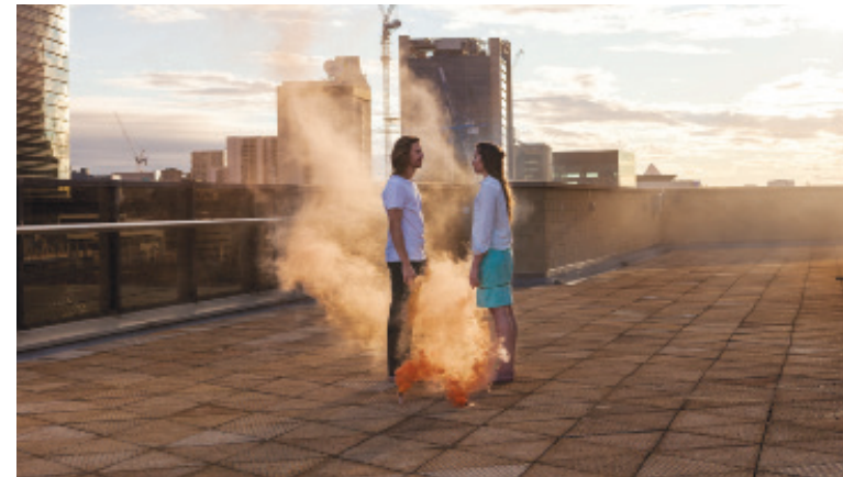
• Proximity Festival - Art Gallery of WA, rooftop view, 2015.