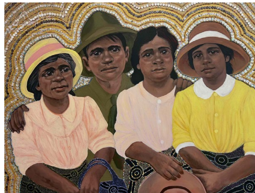
Julie Dowling Warda (Far Away) 2025. Red ochre, synthetic polymer paint, PVP, rhinestones, buttons, mother of pearl on canvas, 100 x 120 cm. The State Art Collection, The Art Gallery Western Australia. Purchased through The Art Gallery of Western Australia Foundation: TomorrowFund.