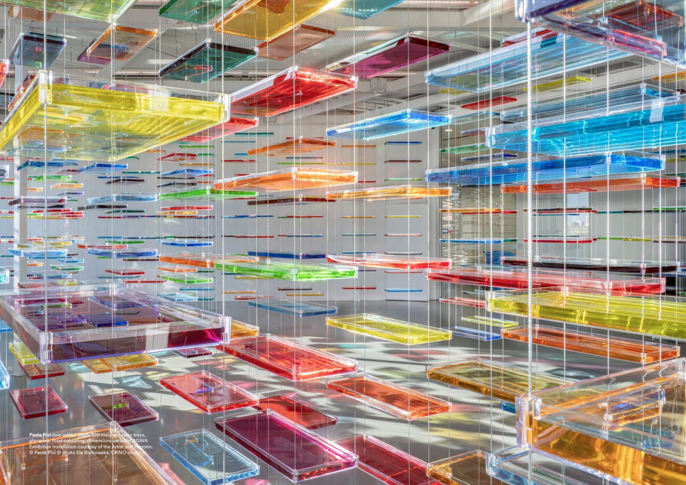
Paola Pivi love addict 2025, 999 moulded resin trays, glycerine, food colouring, dimensions variable, AGWA Exhibition Installation courtesy of the Artist and Perrotin. © Paola Pivi