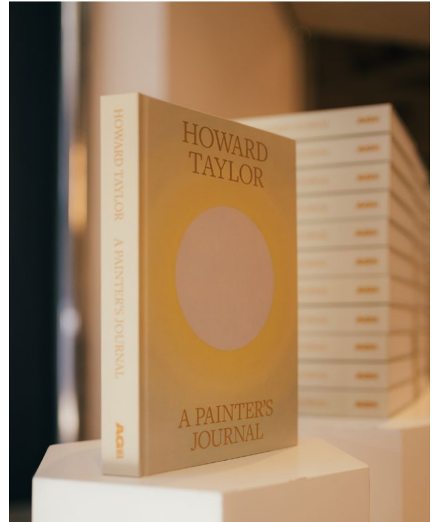
Howard Taylor: A Painter's Journal Book Launch. September 2025.