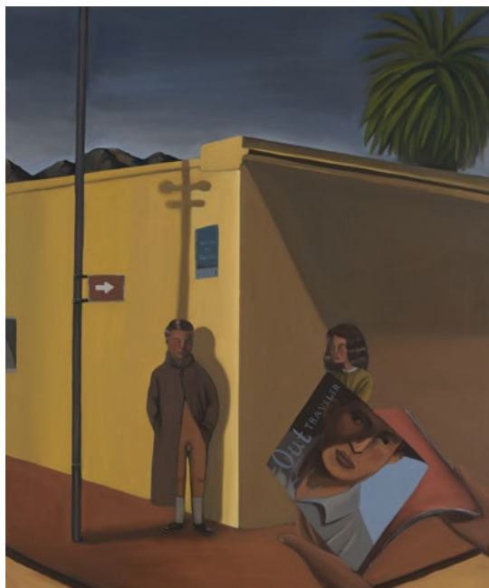
Skyler Chen visiting the Castro 2025. Oil on linen, 100 x 120cm. The State Art Collection, The Art Gallery of Western Australia. Purchased through The Art Gallery of Western Australia Foundation: TomorrowFund.