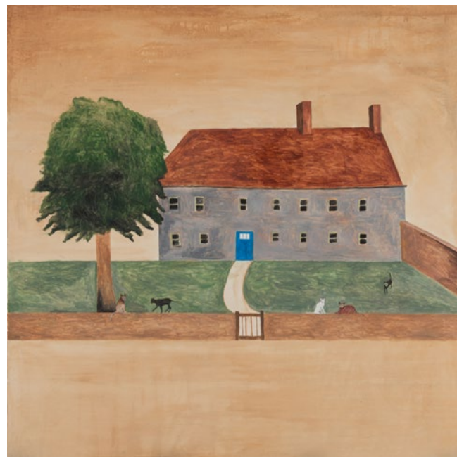
Noel McKenna Building with cats 2023. Oil on canvas, 101.5 x 102cm. The State Art Collection, The Art Gallery of Western Australia. Purchased through The Art Gallery of Western Australia Foundation: TomorrowFund, 2025.