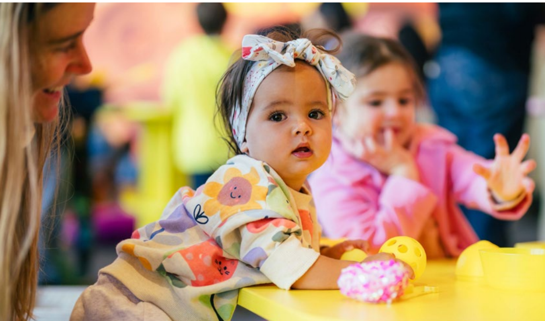
Re-Play Installation View: April 2025.

Donors who made a gift of $1,000+ during the 2025 campaign joined the Annual Giving program, a group of dedicated AGWA supporters who are passionate about art from Australia and around the world and looking to be actively involved in the future direction of their State Art Gallery.