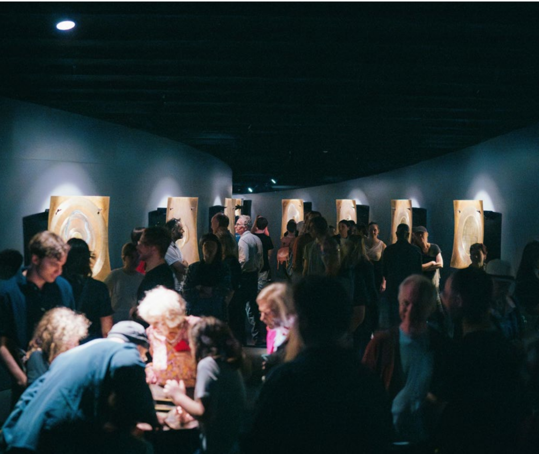
Revivification Launch event. April 2025.

Throughout 2025, our generous AGWA Foundation donors enjoyed a year of enriching, behind-the-scenes experiences that highlighted the impact of their support and deepened their connection to AGWA's mission.