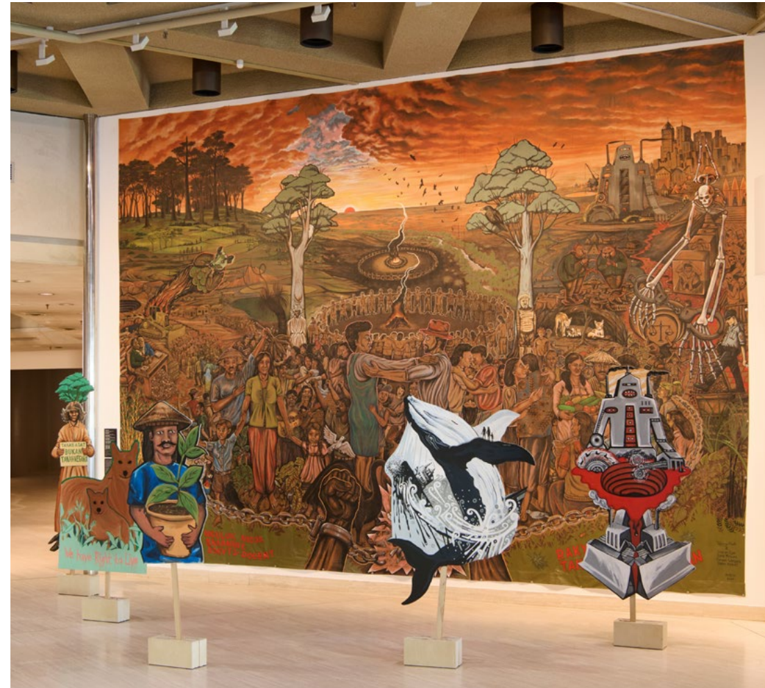
Taring Padi, Sharyn Egan, Yabini Kickett, Ilona McGuire and Tyrown Waigana, Narbinj nguluk nidja doornj baarniny, moorditj dooytjdoornt/ Rakyat Bersatu tak bisa dikalahkan , 2024, acrylic and charcoal on canvas; acrylic on cardboard, 505.5 x 691.8 cm (banner) dimensions variable (wayang kardus/ cardboard puppets). Courtesy of the artists. © Taring Padi, Sharyn Egan, Yabini Kickett, Ilona McGuire and Tyrown Waigana. Photo: Rebecca Mansell.