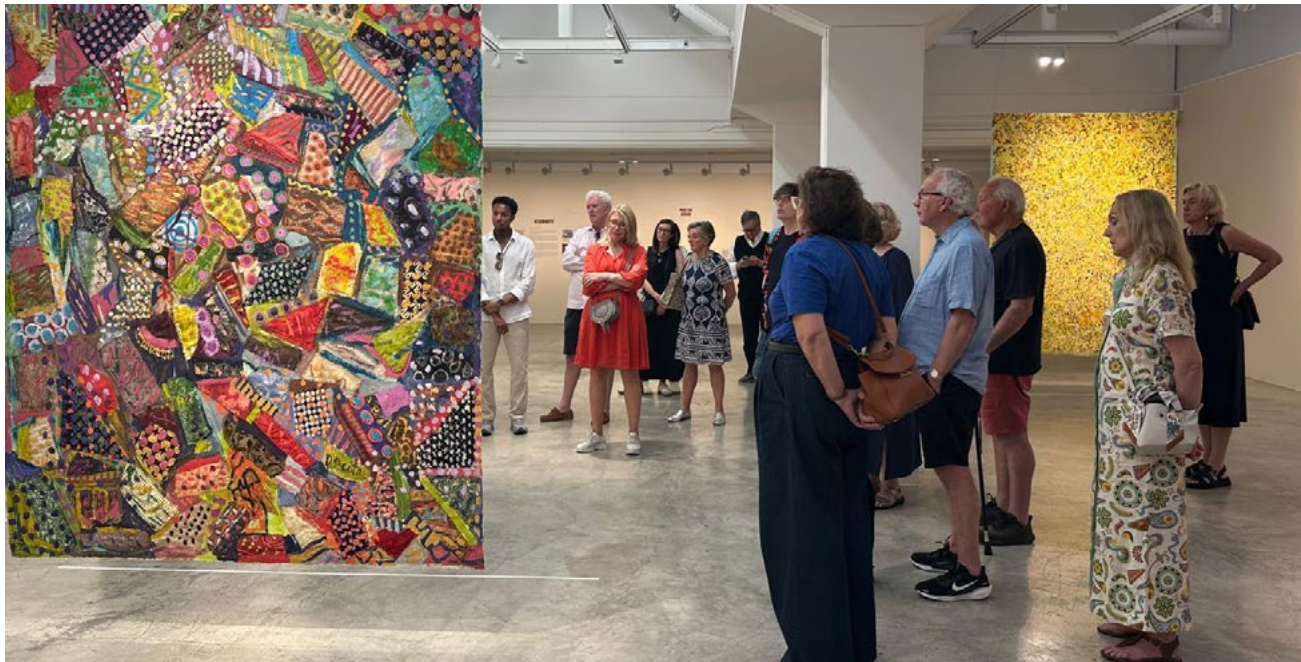
Singapore Art Tour, November 2025

Guests enjoyed private curatorial visits to major institutions, exclusive access to leading artists' studios, early entry to the Singapore Biennale, and invites to prominent commercial galleries and private collections. Thoughtfully curated social events rounded out the experience, with participants already eagerly anticipating the 2026 AGWA Art Tour.