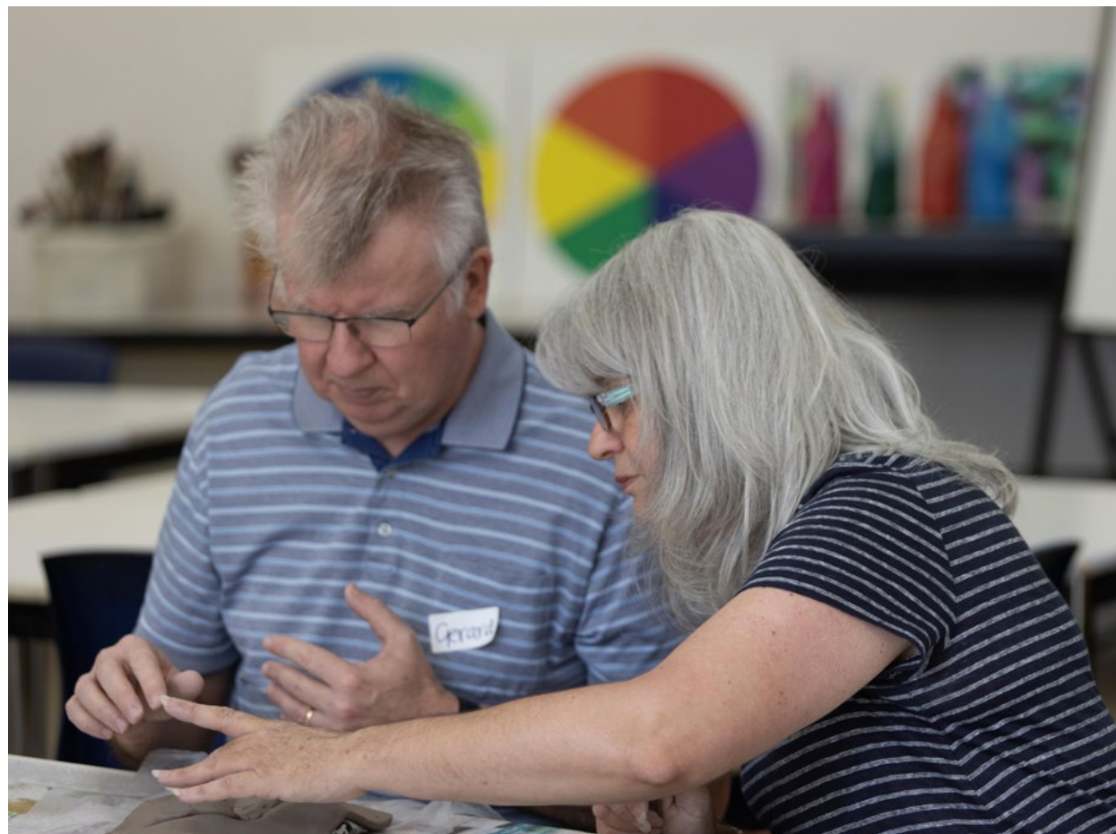
Creative Encounters Workshop: Arts & Dementia.