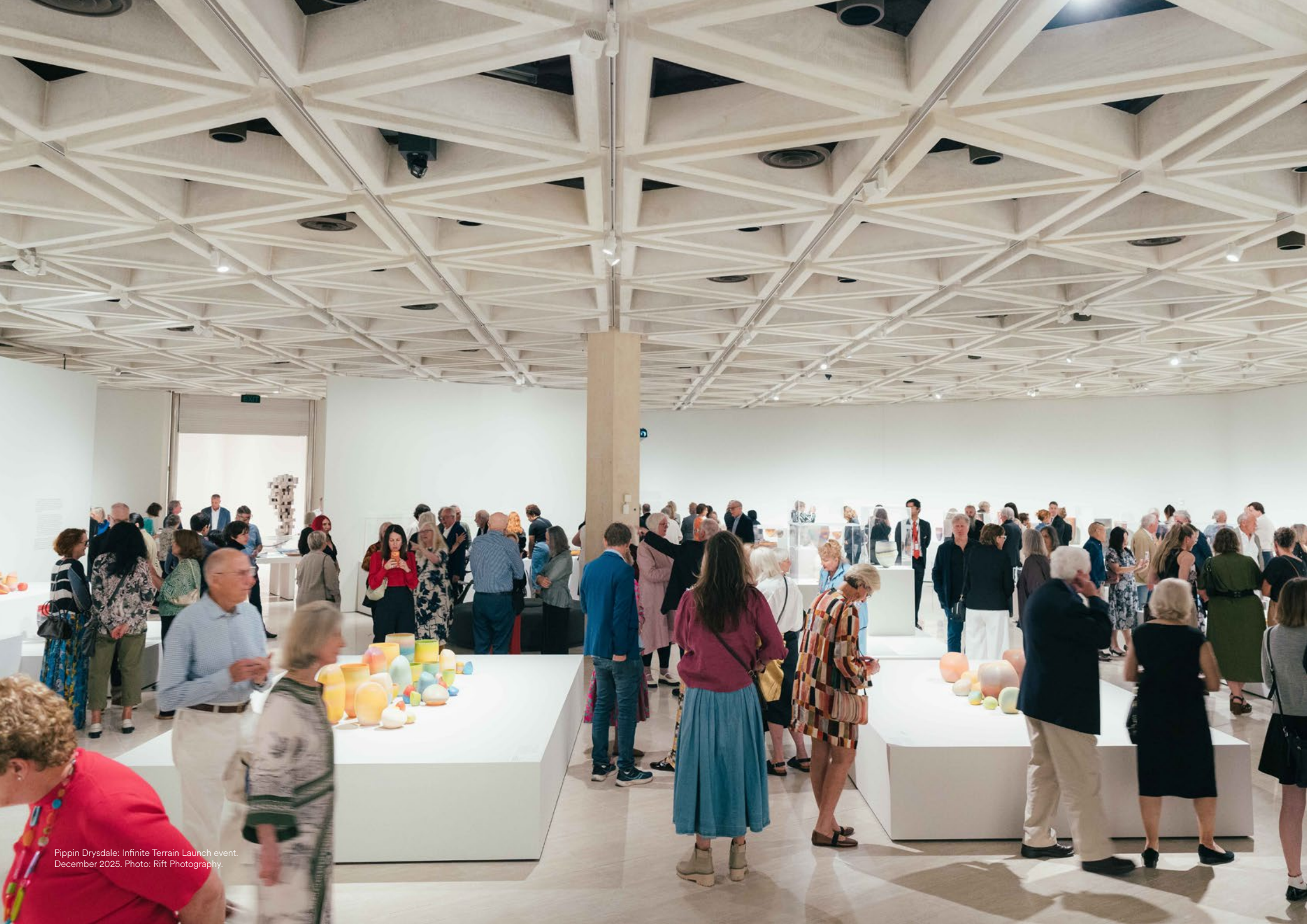
Pippin Drysdale: Infinite Terrain Launch event. December 2025.