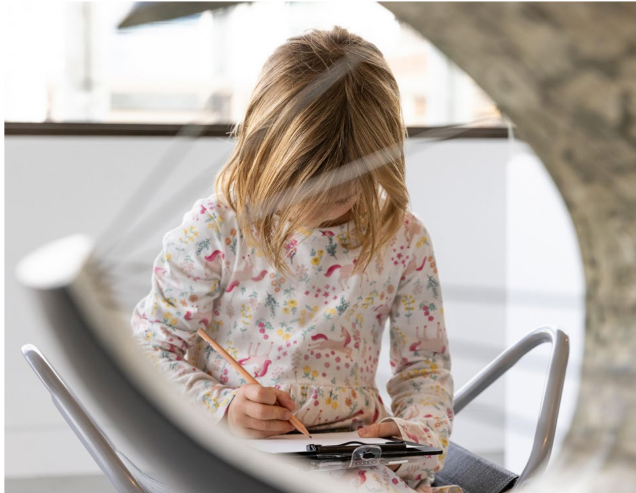
AGWA School Holiday Activities, April 2025.

Foundation growth has been supported by capital invested in the markets since September 2022, professionally managed by an external wealth manager and guided by the stewardship of the AGWA Foundation Investment Committee. This strategy provides a reliable additional revenue stream and strengthens AGWA's long-term sustainability.