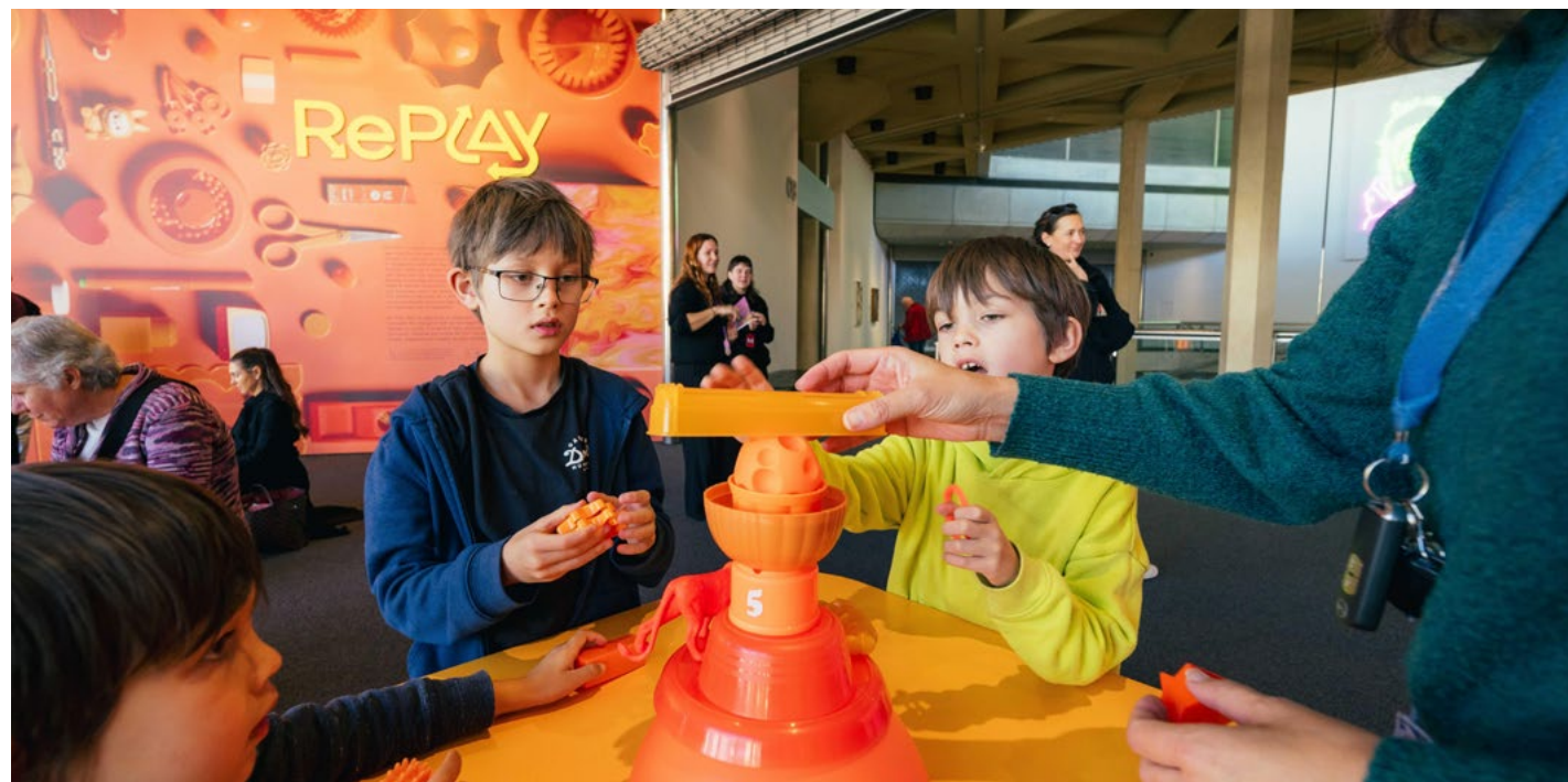
AGWA School Holiday Activities, April 2025.