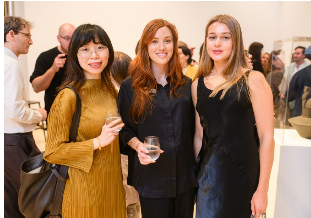
Next Collective, Next Up Pitch Night, October 2025.